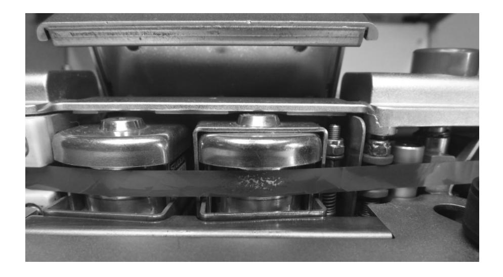
Figure 1. Creases on a tape and localized magnetic coating damage. (Color version available at www.mitpressjournals.org /doi/suppl/COMJ_a_00487 -Pretto.)

both the sides. The expression "video of the tape" will be used henceforth to indicate the video of the back side of the tape. The videos are the input data of the original software tool presented in the following section. They are able to automatically locate discontinuities that occurred during the A/D transfer and to classify them, thus increasing information about the signal that may be useful for philological analysis. The videos used in this work derive from several years of preservation projects and were captured by a professional camera with a 720 × 576-pixel resolution.