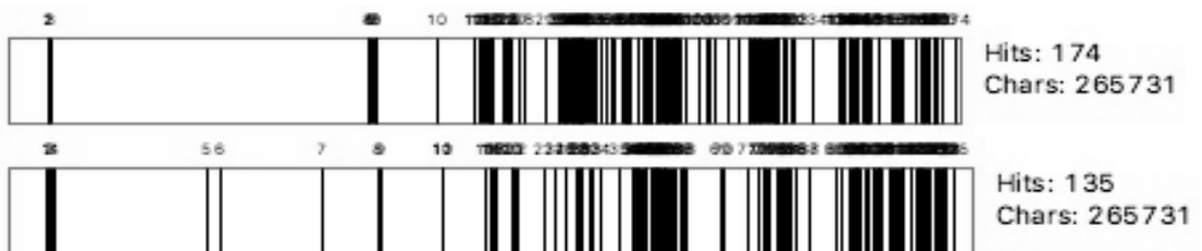
Chart 2. Appearance of the keywords 'Dudaev' (above) and 'opposition' (below) in the first year of the sample.