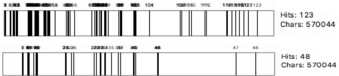
Chart 4. Appearance of the keywords 'Maskhadov' (above) and 'opposition' (below) in the second year of the sample.