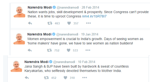
Figure 3. Notion of citizens are labourers

economic ensure that the nation building process is a success. Thus, the concept of labourers is mapped on the citizens because citizens are lower in the hierarchy to the ruling class. This finding opposes Charteris-Black’s (2013) notion of SOCIAL ORGANISATION IF A BUILDING that emphasises on teamwork between political figures and citizens in the process of nation-building. Meanwhile, the findings of this study focused on citizens as labourers who engaged in the physical work of helping the nation to build a solid edifice. Figure 3 displays Modi’s use of the concept of citizens as labourers in his tweets.