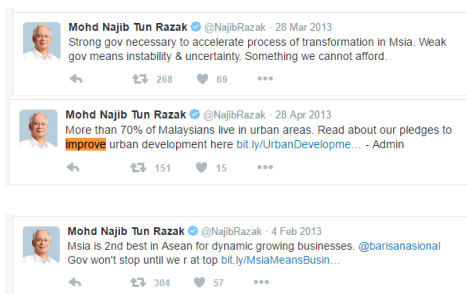
Figure 2. Concept of politicians as nation constructors

The metaphors suggest that Najib and Modi, as constructors of buildings, aim to create a comfort zone for their citizens through the implementation of various projects. The construction of the concept of BUILDING in the national election campaign portrayed a consistent effort by Najib and Modi to construct a futuristic nation in aspects such as the political, social and economic. The results and findings of this study corroborated with the findings of Lu and Ahrens (2008) and Hellín-García (2013), who claimed that POLITICIANS ARE NATION CONSTRUCTORS and builders are politicians who possess a significant role in developing and maintaining a democratic nation. Therefore, the findings supported Lakoff and Johnson’s (1980) notion, ARGUMENT IS A BUILDING. Figure 2 portrays the notion of nation constructors.