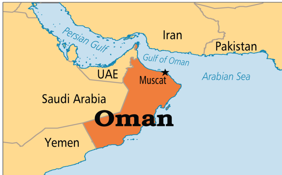
Figure 1.1: Sultanate of Oman map

Identifying risk is the first step of the Risk Assessment of Safety and Health (RASH) method, in which potential risks associated with projects in construction are identified. As an integrative part of identifying risk, this classification of risk attempts to organize the various risks affecting building construction. The impacts of occupational illnesses and injuries affect not only safety and health, but also economics, due to the high costs associated with work injuries. Hinze et al. (2006) noted that safety and health in construction have obtained attention because of workers' increasing insurance compensation premiums, resulting from immense cost increases in medical care for convalescents and work injuries.