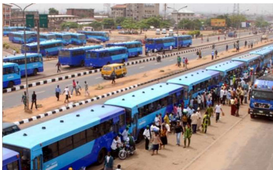
Figure 3: Bus Rapid Transit (BRT) Loading 'Lagosians' at a Bus Stop in Lagos