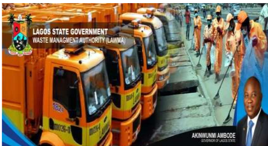
Figure 1: Lagos Waste Management Authority (LAWMA) and Staff on Duty

Having an effective and efficient waste management board is a sign-qua-non to achieving a clean environment. Research has shown that settlements that are very serious with having a clean environment do not joke with this essential WMB (Tipping, et al., 2005). Lagos, Benue and Kwara States are front liners in this essential service-oriented board in Nigeria as shown in Figure 1 below for Lagos Metropolis. Abuja municipal waste management board also ensures that daily parking of solid waste around town for onward recycling is done. Most states in the South East though have this ministry but are not very efficient.