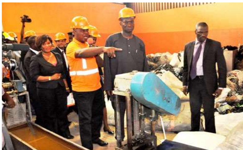
Figure 2: LAWMA Managing Director at Lagos Nylon Recycling Plant

Ministry of environment in many states in Nigeria are mere a bunch of workers who are mainly concerned about collecting salary at the end of the month. In fact, besides Lagos State, Kwara State, Niger State and FCT (Abuja) most other ministry of environment can be described as 'moribund'. This ministry among other functions should deal with cleaning the environment, ensure that solid wastes are moved to the appropriate place for recycling as shown in Figure 2 below or buried, clean city drainages for free flow of water, ensure that city roads, especially access roads are in good condition and so on. However, there are ministries of environment where these functions are not reflected in their immediate vicinity let alone other cities within a state. Oyo State ministry of environment is putting up her best in the last few years but the resources available is not commensurate to the volume of work in Ibadan being the largest city in West Africa.