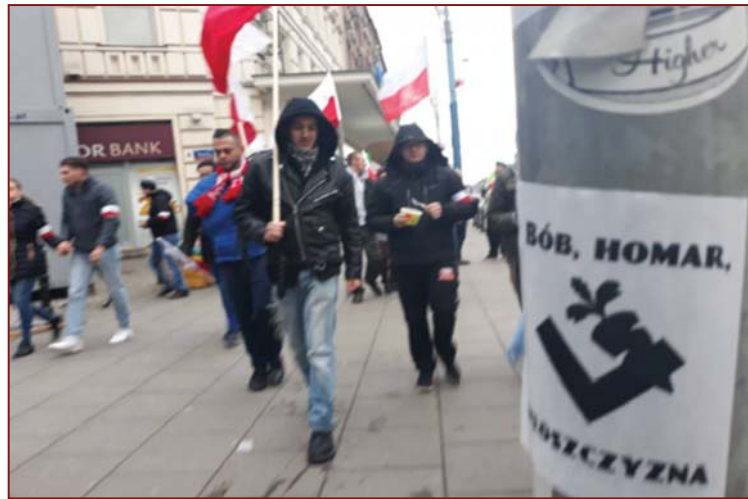
Figure 3: Picture of the sticker art subverting the ‘God, honor, homeland’ slogan. The sword in the nationalist Falanga symbol was replaced with a carrot. In the background: participants of the Polish Independence Day celebrations 6

In the context of these varied experiences in engaging with the feminist agenda and combating the anti-feminist (anti-progressive) movement in Poland, I would be tempted to say that the less academic my intervention was, the more powerful. The less wordy, the more it was read. At the same time, however, I realize that while this bottom-up urban activism was not academic in its character, it would have never taken place had it not been for my academic background and inspirations. Without the ‘academic moments’ the ‘activist moments’ would not have been possible. Taking up, once again, Gramsci’s concept of historic bloc, I would see my academic writing and my every-day, pop-culture or urban-culture gestures as attempts to intervene on different levels in a social movement which is complex, multi-dimensional and multi-faceted, as attempts to disrupt the existing historic bloc.