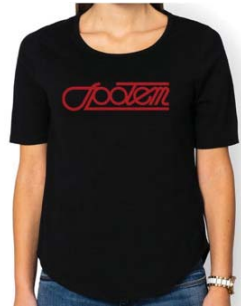
Figure 1: T-shirt with logo of co-operative founded in the era of People’s Poland – image produced using creator on megakoszulki.pl website.

Over the last few years I experimented with three different forms of expression, which, I hoped, would allow me to express my sentiments in a more direct manner, by intervening directly in the public space. The first one was t-shirts. As ‘patriotic clothing’ was becoming a trend in Poland (including brands such as ‘Red is Bad’ opening shops on main shopping streets in Krakow and Warsaw), I decided to experiment with the idea of reclaiming symbols of People’s Poland. I chose not the overtly ideological ones which are not only extremely loaded symbolically, but also explicitly banned by the Polish law – but symbols of institutions which in today’s capitalistic regime could be looked upon with nostalgia, such as beautifully-designed logos of various co-operative initiatives. While my ‘Społem’ (co-operative grocery store) t-shirt was commented on favorably by friends, and a bit ironically by family-members belonging to the older generations, it failed to realize its goal, as it was not perceived as a political or ideological intervention, but rather as a playful borrowing of vintage logotypes in the vein of hipster aesthetics.