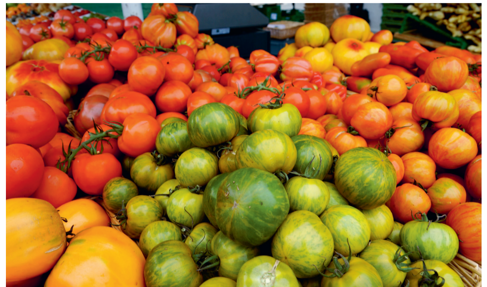
Diversifood vegetable varieties