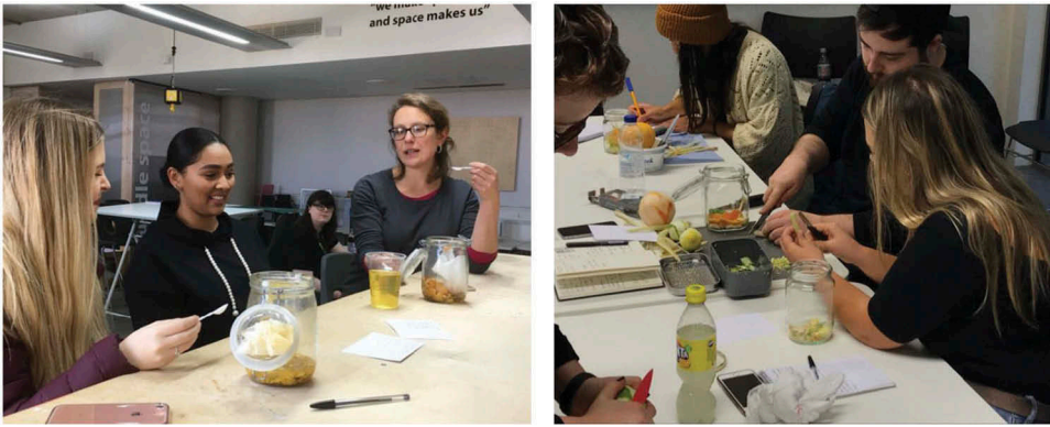
Figure 1. Urban Antibodies studio workshop with guest artist Rebecca Beinart: Students preparing homemade tonic water via hot/cold extraction using cinchona bark, citrus and aromatic spices, and taste-testing it 24 hours later.

Focusing on the relationship between how the trade of quinine and the production of anti-malarial medication facilitated the project of colonial imperialism, Beinart led a workshop (Figure 1) on how to produce homemade tonic water. Using a recommended baseline quantity of cinchona bark, students elected whether to use hot- and cold-extraction, and experimented with their own combinations of various citrus fruit zests (limes, lemons, oranges, and ruby grapefruits) and other aromatics to add flavour. Each 'recipe' was noted, and the containers were sealed and stored to steep overnight for the following day's taste-test.