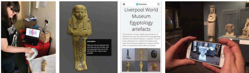
Figure 2. Unshelved project: 3D scanning and augmented reality/online presentation of Ancient Egyptian artefacts from Liverpool World Museum's collections.