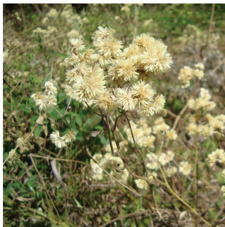
FIGURE 1: Inflorescences of Achyrocline satureioides (Lam.) DC., Asteraceae.

We also have recently described the simultaneous incorporation of these poorly soluble flavonoids of Achyrocline satureioides extract into nanoemulsions by means of spontaneous emulsification intended for topical use [6]. Such a procedure proved to be able to efficiently incorporate the main flavonoids from the hydroethanolic extract in monodisperse nanoemulsions (200 nm range) consisting of a medium chain triglycerides oil core stabilized by a binary mixture of surfactants (egg lecithin and polysorbate 80). Flavonoids seem to be located in the oil phase of nanoemulsions since they were not detected in the aqueous phase after separation on ultrafiltration membranes. The 3- O -MQ release rate was influenced by the extract content in the nanoemulsion with approximately 90% released after 8 h of kinetics. The first-order model provided the most satisfactory fitting of the release data from extract-nanoemulsions [6].