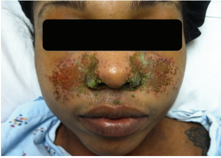
FIGURE 1: Case 1 demonstrates facial eczema herpeticum.