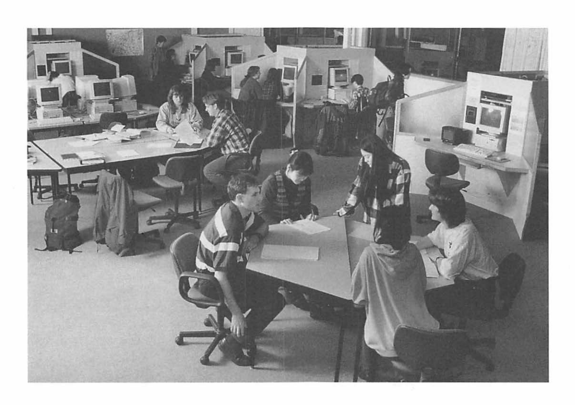
C.A.L.L (Computer-Assisted Language Learning) Facility, Language Centre, University of Victoria.