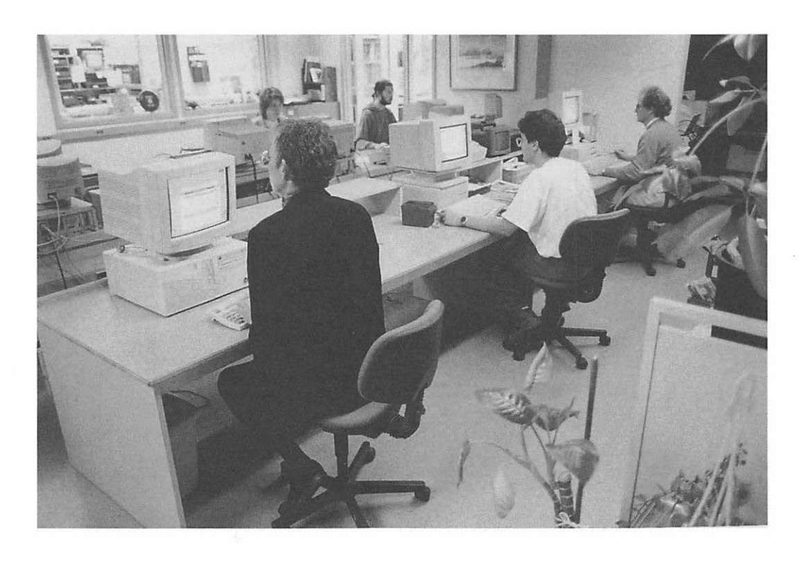
Research and Development Facility, Language Centre, University of Victoria.