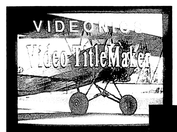
Figure 3. Sample titles