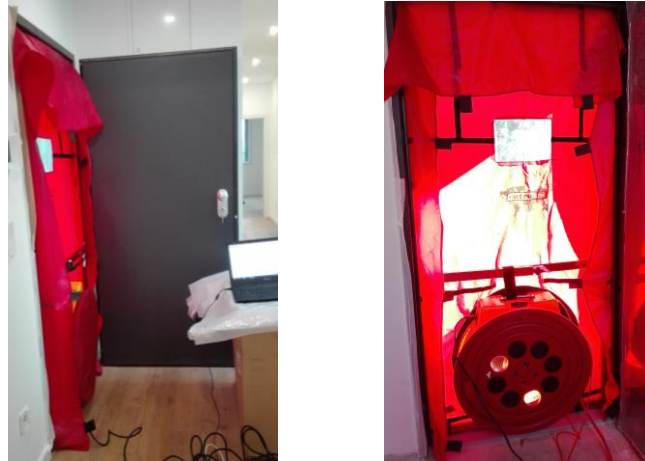
Figure 3: Blower door setup for in-situ airtightness measurement

In the in-situ case study, the airtightness measurements occurred during the construction stage and at commissioning. The tests were performed with the blower door Retrotec1000 model (Figure 3), following the procedure described in the standard EN13829-2000.