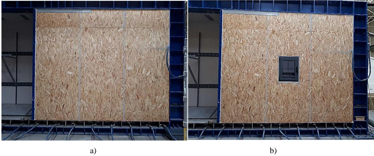
Figure 2: SIP modules tested: a) wall assembly; b) with a side hung window.

The in-situ case study corresponds to a single floor modular dwelling built in the north region of Portugal. The slab is of reinforced concrete. The rest of the structure is made of the SIPs. As referred before, an additional exterior cover of magnesium oxide-based boards was added to the SIPs and covered by a synthetic mortar reinforced with a fiberglass net. On the interior side, a plasterboard finishing was applied. The roof is composed of the same SIPs with an additional liquid waterproofing layer on the exterior surface. All the exterior openings, with the exception of the entrance door, are double glazed side hung aluminium frames. There are mechanical exhausts in the bathrooms and kitchen and grilles for fresh air admission in the living room and in the laundry.