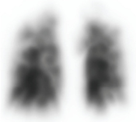
FIGURE 2: A lung perfusion scan showed multiple wedge-shaped perfusion defects in both lungs.

Following the diagnosis, the patient was treated with the anticoagulant warfarin, 1 course of chemotherapy with irinotecan (80 \text{mg}/\text{m}^2 on days 1, 8, and 15), and long-term oxygen therapy. Her shortness of breath upon exertion significantly improved initially; however, her respiratory condition gradually worsened, and follow-up CT scans showed multiple liver and bone metastatic lesions. Echocardiography indicated worsening pulmonary hypertension with tricuspid regurgitation, and the estimated gradient pressure was approximately