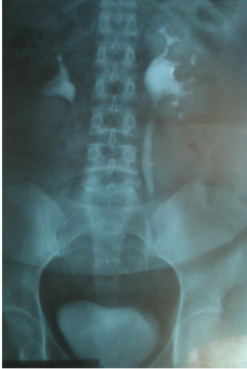
FIGURE 1: Excretory urography showed dilatation of left ureter.