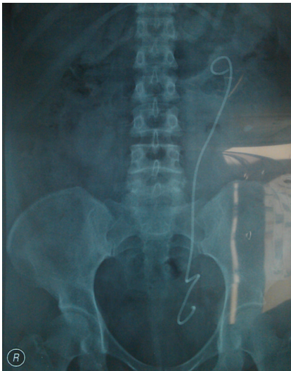
FIGURE 2: The Omega-like shape of the lower ureter after double J catheter insertion.

a suture has pulled the ureter from the lateral serosa of the upper part to the lateral serosa of the lower part as seen in Figure 3. Also the luminal segment of the ureter was intact so that a double j stent could be inserted. Intraoperatively the strictured area was excised and a successful reconstruction was performed with open ureteroureterostomy. The patient remains asymptomatic, with normal renal sonogram, 2 months after the procedure.