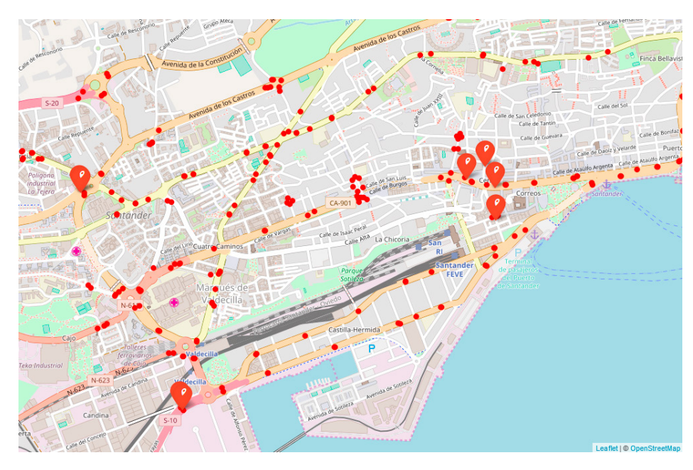
Fig. 1. Partial picture of the sensor network with more than 300 inductive loop detectors (the red points) in the City of Santander. Selected candidates for experimentation appear as red markers, where some of them are located at urban freeways and others in urban streets.