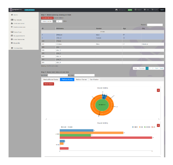
Figure 2: Medical and social professionals can access the reporting service through their user accounts in order to check the current status of the users they take care of (PLWD and Caregivers at risk).