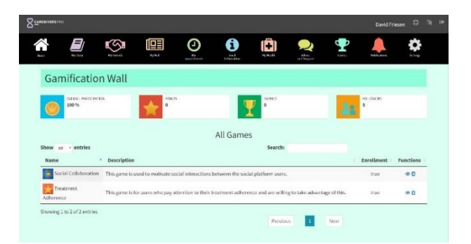
Figure 3: User gamification wall and reward indicators

Designing a gamified social platform for PLWD and caregivers