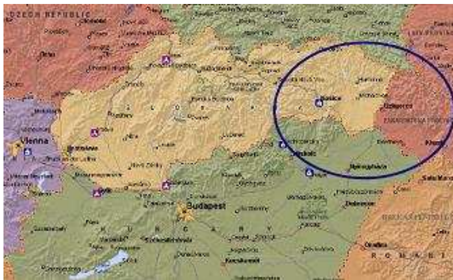
Figure 4.: Area of the Carpathian Supplier Cluster

The Carpathian Supplier Cluster wishes to finance its activities from applications. The necessary business infrastructure will be provided by Zempléni Regionális Vállalkozásfejlesztési Alapítvány (Zemplén Local Enterprise Foundation).