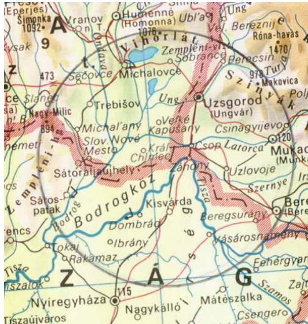
Figure 2.: Map of the tri-border region