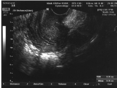
Fig. 1 - Endometrial evaluation.

Sensitivity mature follicle, endometrial thickness and triple line pattern are high, but all of those parameter have low specificity.