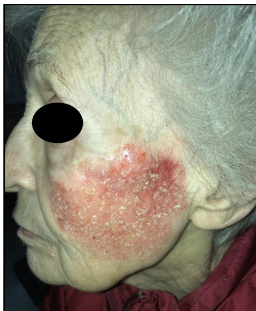
Figure 1: Large scaly erythematous plaque on the left cheek

Dermatological status showed scaly, slightly elevated erythematous plaque with dimension 9 x 7.5 centimetres and well-demarcated borders from the surrounding healthy skin (Fig. 1).