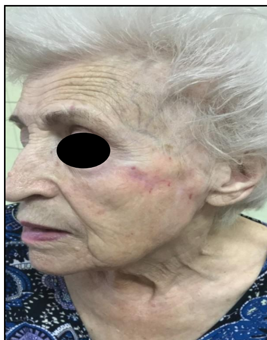
Figure 4: Complete healing of the Bowen's lesion after 6 months treatment with 5 % imiquimod

Treatment with 5% imiquimod cream was initiated 3 times weekly for 4 months. For the following 2 months, the application was reduced to 2 times per week. Impressive healing of the skin lesion was achieved [Fig.4]. Ten months follow-up did not show recurrence of the lesion.