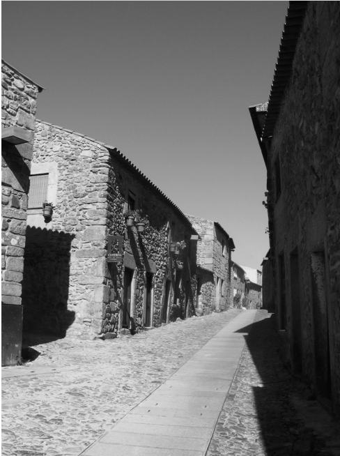
Figure 3 – Tourist accommodation (on the left side of the picture), houses, barns, and canal infrastructure buried in the main street of Castelo Rodrigo.