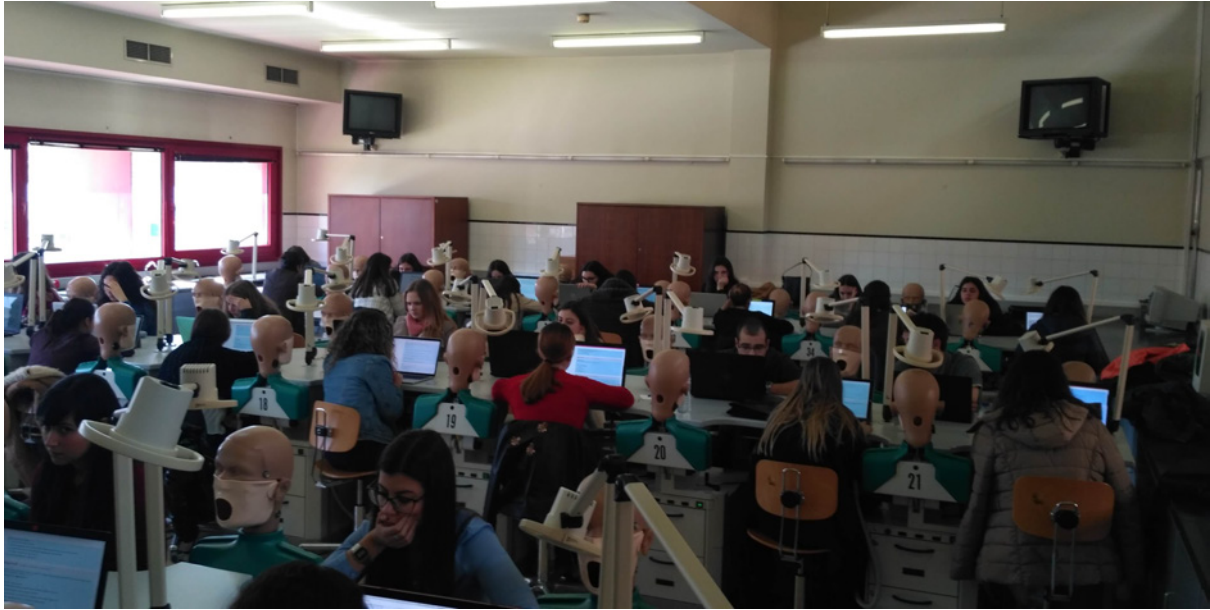
Figure 2. Students taking a BYOD exam at Faculty of Dental Medicine