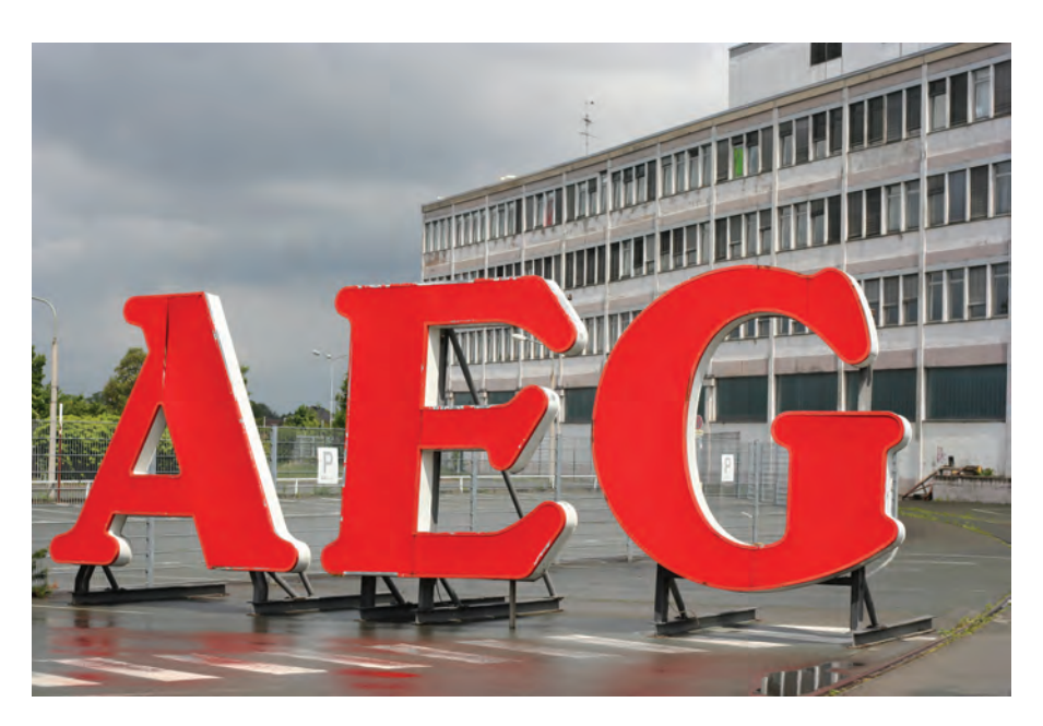
Figure 3. The AEG sign, which was highly visible on the top of the AEG main office building, now, after the closure, stands besides the building.

describes his relationship to his former workplace when he explains that he never felt like 'just a number'.