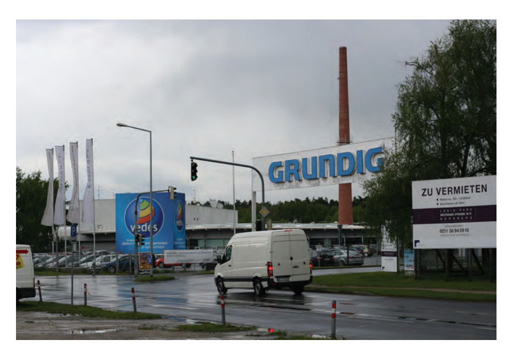
Figure 2. Former main entrance of the Grundig plant

This emotional attachment to a place is made clear by an accompanying narration that articulates identity. The interviewees do not set their life narratives and experiences in a direct relationship to a class position. Their narratives are the constructions of individuality. It may be argued that this is because any inference of lifestyle, behaviour or interests resulting from class membership, casts doubt on individuality. Class is in constant contradiction to a powerful social discourse that propagates individual freedom and self-fulfilment.<sup>33</sup>