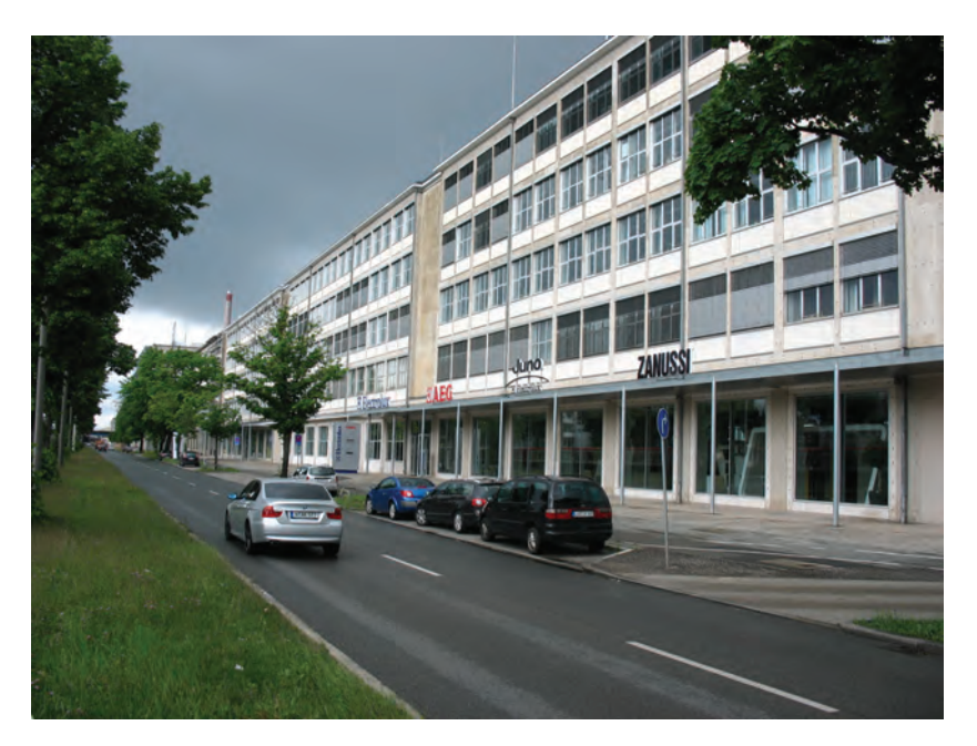
Figure 4. Former AEG building seen from the Fürther Strasse. This area is now used for various purposes.