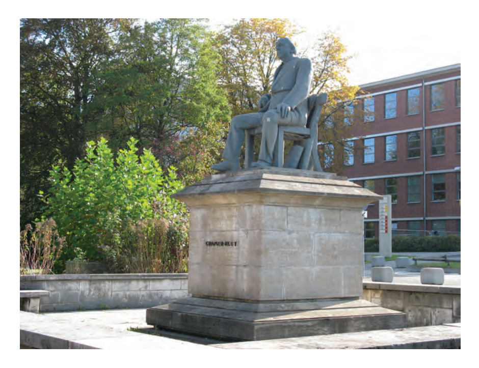
Figure 5. The statue of Mr Cramer Klett, now in front of the newly erected Frankencampus.

By sharing their common memories within their conversation, together they awake the haunts of walls and buildings. The now absent former structure is born again through the common memory of the former workers. And these memories also trigger recollections of social relationships within the workplace, former working routines and everyday body movements, all of which are expressed in the interviews.