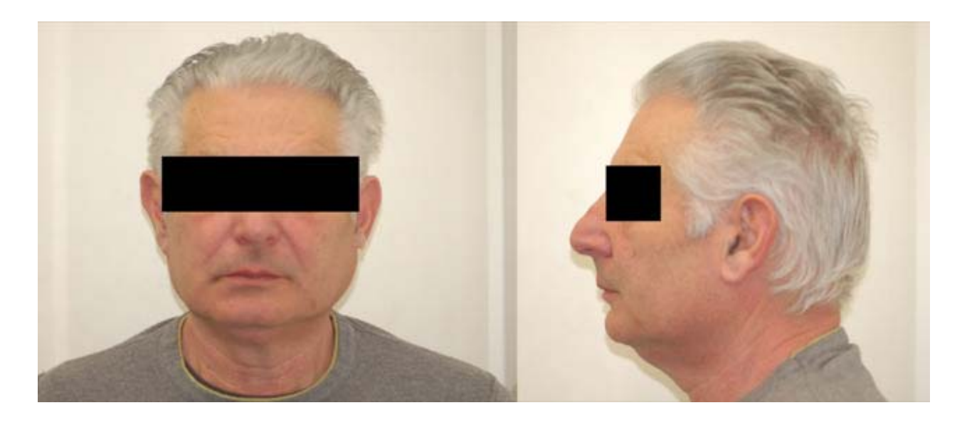
Fig. (1). Unilateral parotid swelling on the left side (frontal and sagittal view).