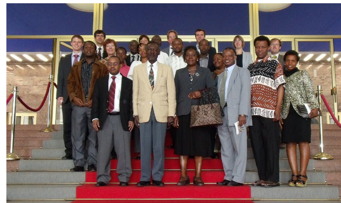
The TGCL group also paid a visit to the German Federal Foreign Office.