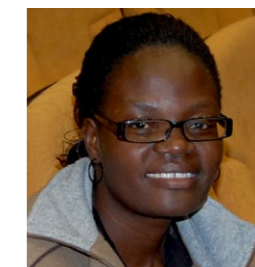
Dr Tulia Ackson