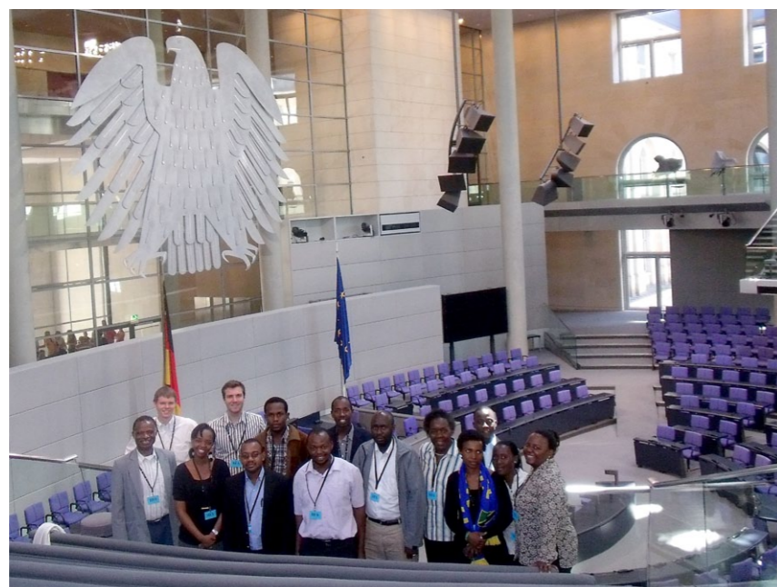
The TGCL Summer University participants visited the German Parliament.

On the agenda for the three day stay were a visit to the German Ministry of Foreign Affairs, a courtesy call to the DAAD Berlin Office, a visit to the