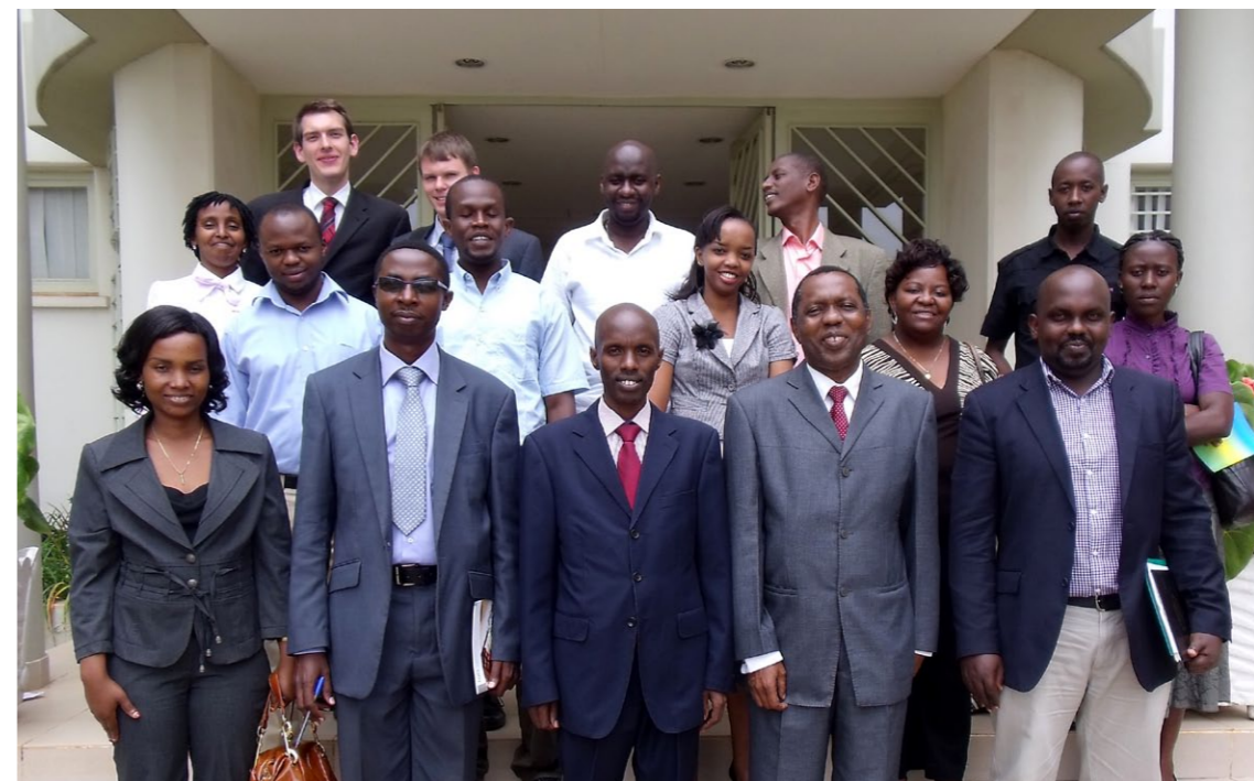
The TGCL group was received by a delegation of the Supreme Court of Rwanda.

A group of TGCL LLM students, accompanied by their student adviser and by the TGCL managers, visited the capital of Rwanda to get to know the leading Rwandan legal institutions.