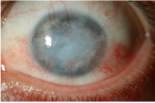
Figure 1 Example of total limbal stem cell deficiency following a chemical burn. Note the opacification of the cornea and the presence of neovessels over 360°.

intertwined, particularly in the case of parents and children. In the context of life-threatening conditions like liver failure, for example, a family member may feel that preventing the death of a loved one, by donating a liver lobe, is of direct benefit to them—it avoids (or postpones) the pain of bereavement.