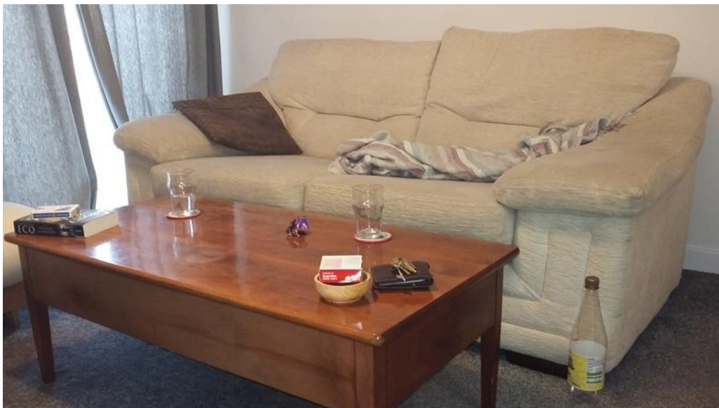
Figure 4. Photograph accompanying the acquaintance rape scenario in Study 3.

Materials and procedure. Participants first read the same scenario employed in Study 1, and examined a crime scene photo depicting a sofa, a table, and other neutral objects (see Figure 4).