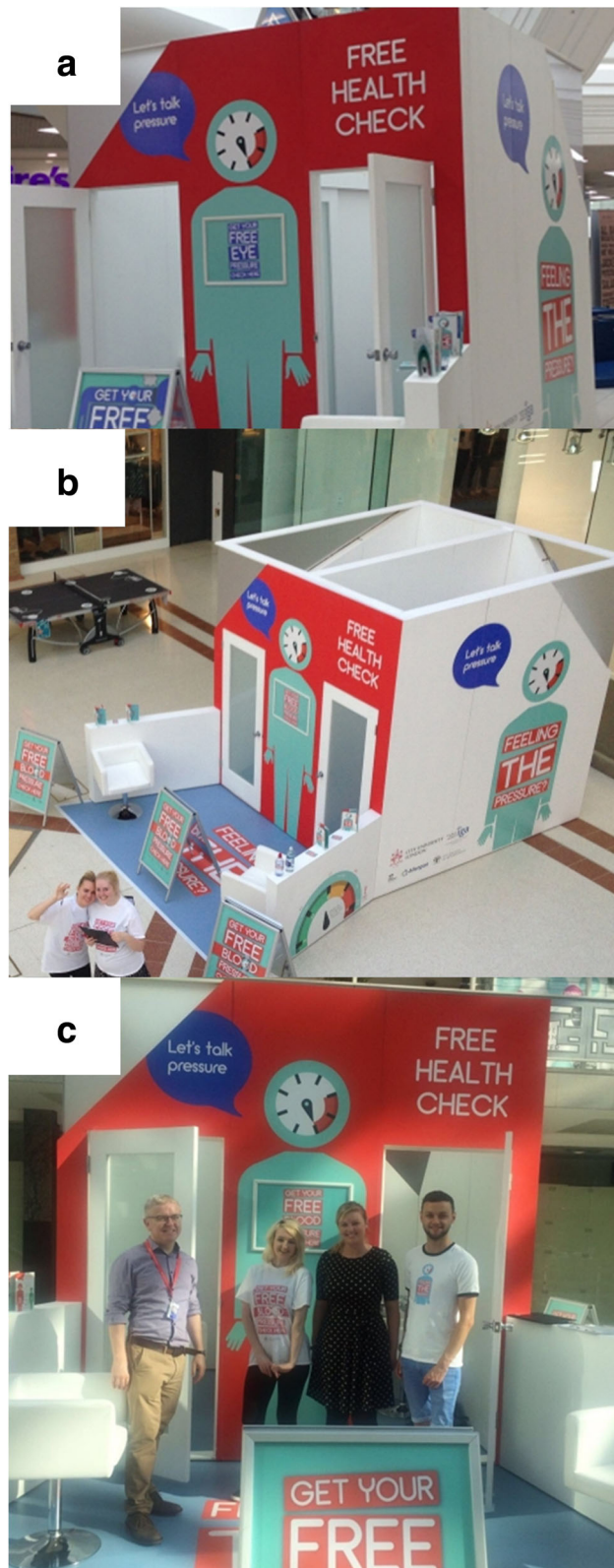
Fig.1 (See legend on next page.)