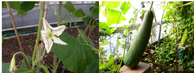
Figure 4. The seed library provides the seeds, images, and advice on how to hand pollinate the kodu flower at night.

The visions of the global food industry are typically abstracted and alienated from the lives on which our food depends – typically a devalued migrant labour force, and other species – as well as the soil in which it is grown, and the contingencies of climate. Designing for care asks us to pay attention to marginalised labour practices and the bodies that perform them. For example, the seed library makes available the seeds of the kodu plant along with the expert knowledge required to grow it successfully in London (see Figure 4). Lutfun, a seed guardian, tells you how, in Bangladesh, the flower is pollinated by a moth at night. In London, the kodu plant must be hand-pollinated in the evening when the male flower is open. Without this knowledge or work the kodu won't produce any gourds nor seeds, so the presence of seeds in the library signifies that this labour has been performed successfully. By sharing the seeds along with the " expertise of the migrant community " (Richard, seed guardian) to ensure the proliferation of community growing practices, the seed library participates in spatial autogestion by restructuring power relations, and making evident the embodied, specific and situated practices of care and labour that are required for multispecies flourishing in hybrid digital-physical space.