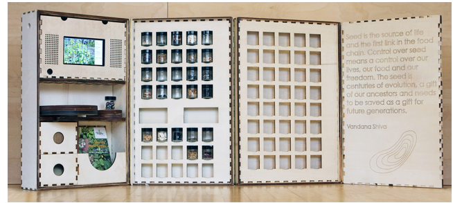
Figure 2. Connected Seeds Library

particular seed (Where these seeds came from; How I grow them; Tips and tricks; Recipes; How to save the seeds).