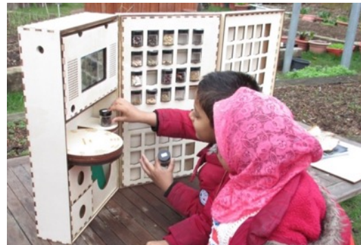
Figure 3. Engaging with the Connected Seeds Library

The interactive elements are built from a Raspberry Pi and screen, an RFID reader, a battery, and a speaker. The seed jars are tagged with RFID tags that link to their digital records. Visitors can join the library for free, take seeds home, and bring some back at the end of the season to maintain the living stock. The seeds also come in packets with QR codes that link to webpages with the digital content. The Connected Seeds Library is a new addition for the community from the project and continues to be used as a local resource at its permanent home at the farm.