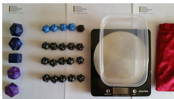
Fig. 1. Example of required materials: 25 objects, a weighing scale and a draw bag. Note that we have small/large and blue/not-blue objects. [Colour figure can be viewed at wileyonlinelibrary.com ]

Explain that the trivial solution to weigh all the objects is often not possible. Instead, if we knew the mean weight of an object, we could calculate the weight of the bag as 25 times the mean weight. Hence, the weight of the bag is equivalent to knowing the mean object weight. There is no prior knowledge about the objects, so we will take a sample of objects and use these to estimate the population mean object weight; here, we introduce the concept of a sample mean (or fully, the sample mean weight).