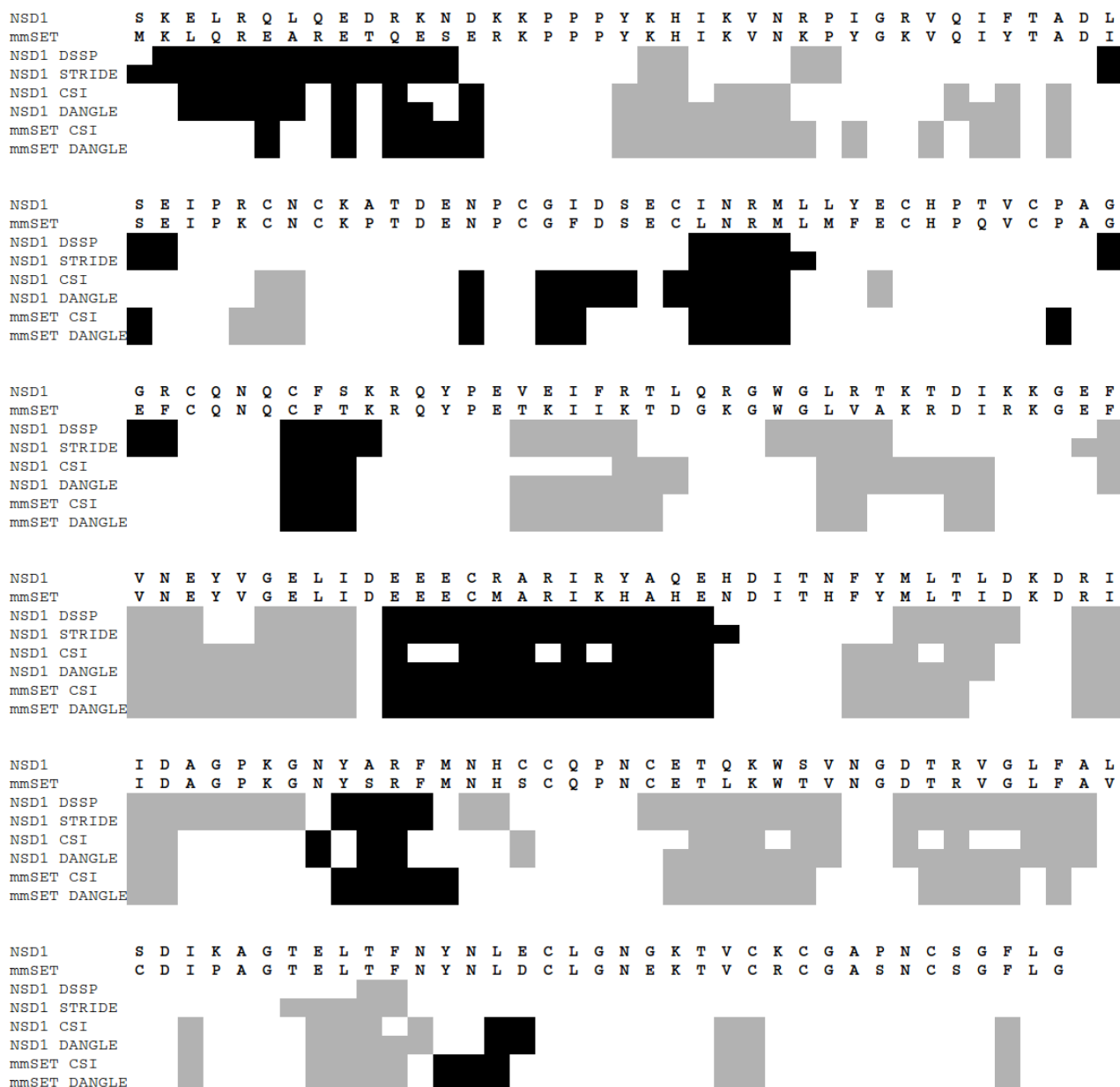
Figure 3. Sequence alignment between NSD1 and NSD2, illustrating similarities in secondary structure. Alpha-helices and beta-sheets are depicted as black and grey squares, respectively. In each block: Rows 1 and 2 show the sequences of NSD1 and NSD2 respectively. Rows 3 and 4 show the secondary structure of NSD1 as derived from the crystal structure. These have been defined using the programs DSSP (Kabsch and Sander, 1983) (row 3) and STRIDE (Heinig and Frishman, 2004) (row 4). Rows 5 and 6 contain the NMR-derived secondary structure of NSD1, calculated using the programs CSI (Hafsa and Wishart 2014) and DANGLE (Cheung, Maguire et al., 2010), respectively. Rows 7 and 8 contain the NMR-derived secondary structure of NSD2, calculated using the programs CSI and DANGLE, respectively.