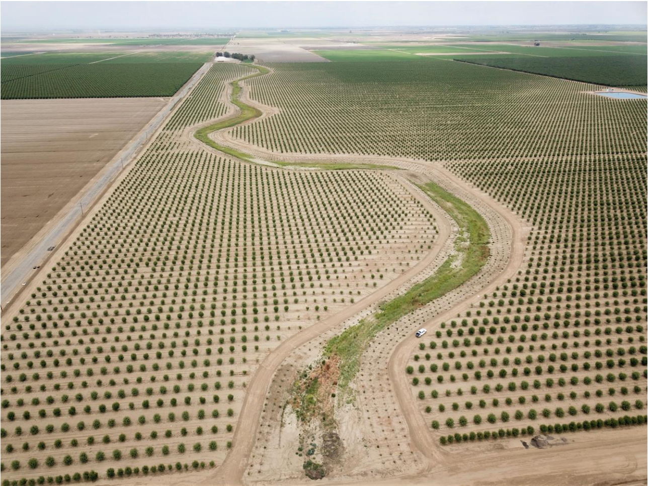
176 Figure 2. Recently planted habitat for natural enemies and pollinators incorporated into a landscape 178 design at a large holding in California’s San Joaquin Valley (USA). This 2.3-mile corridor of hedgerows and meadow was planted as part of the Xerces Society’s Bee Better Certified™ 180 program.