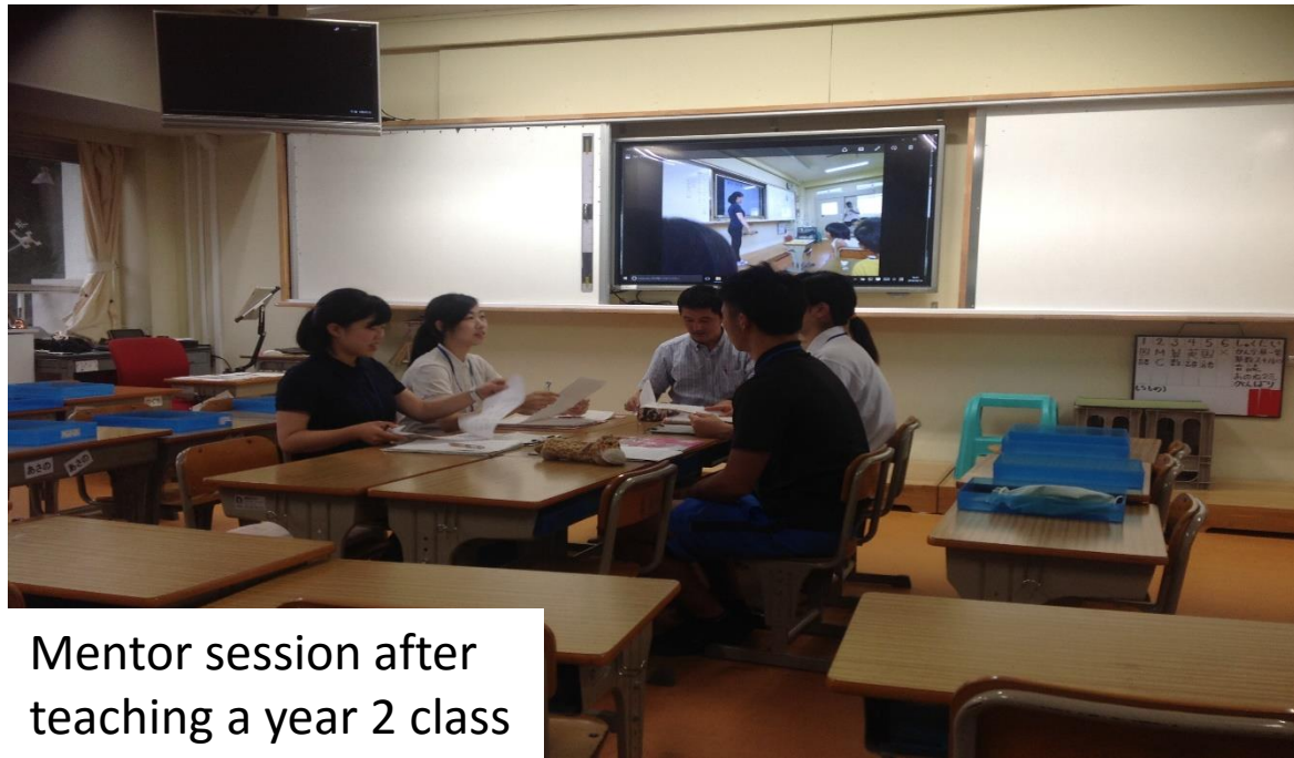
Mentor session after teaching a year 2 class

An example of one of the Japanese feedback sessions observed.