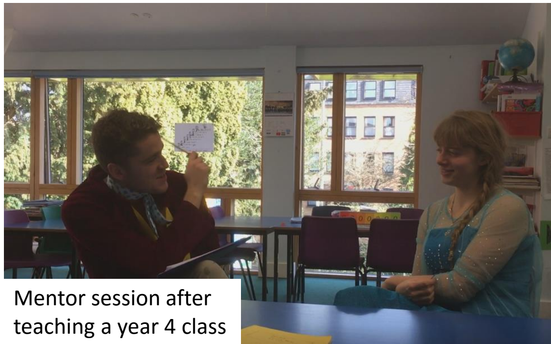
Mentor session after teaching a year 4 class

An example of one of the UK feedback sessions observed.