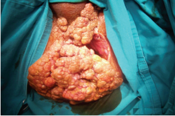
FIGURE 1: BLT covering all the perianal region.