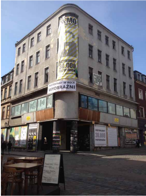
Figure 2 Squat Od:zysk in Poznań with banners stating ‘We are taking back 30,000 vacant buildings’ and ‘Vacant buildings in the hands of imagination’

squatting and connected initiatives are highly politicized and ideologized in Poznań, with a heavy influence of anarchism.