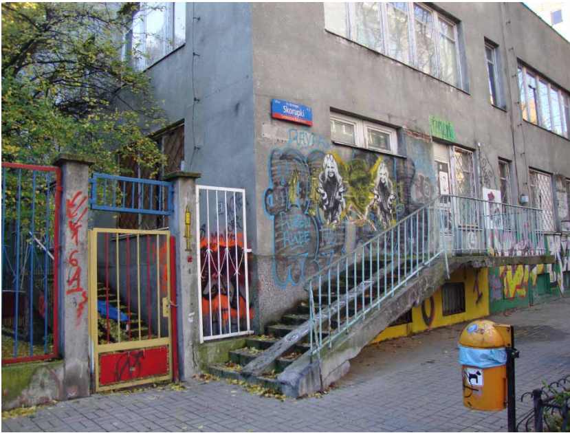
Figure 5 Przychodnia squat in Warsaw

‘Warsaw Tenants’ Association owes the squatters for these talks. It is true, because when the squat on Elblaska, Elba, was totally unrightfully terminated there was a manifestation in Warsaw. It was quite big and I think that the authorities are afraid of exactly that. And I think that there was none like that before. Indeed it was quite numerous and I even saw some social workers joining it. On this big square with good location. To do a demonstration over there that would be visible is quite hard, but a lot of people came actually. I think this was the reason why Warsaw authorities decided to have these talks. Because squatters gave a postulate on this round table and it is why it is taking place, it is why it exists, you know.’ (1)