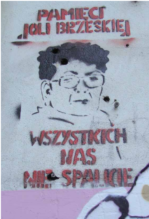
Figure 6 Jolanta Brzeska as a mural on one of Warsaw's squats with the text 'To the memory of Jola Brzeska, You will not burn us all'

positions vis-à-vis local authorities. As put by one of the squatters: