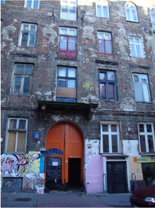
Figure 4 Syrena squat in Warsaw

Squatters and tenants initiated the Tenants' Round Table in 2012 following the eviction of a squat (Elba) in the city in March 2012 that was perceived by the activists as a threat and a pursuit of the authorities to extinguish the alternative scene in the city. Two factors put pressure on the local authorities to start a dialogue with squatters: the first was the gathering of a large number of supporters (2000 participants, quite a remarkable number for this kind of protest) at the demonstration following the closing down of Elba squat, and the second, the squatting of a municipal building (Przychodnia) (Figure 5), shortly after the closing down of Elba. For the first time since the first squat was opened in the city, local authorities were willing to start a dialogue/negotiation with squatters. The squatters' strategy, at the point of time when they perceived their position as favorable (an opportunity), was to form a formal alliance with tenants' organizations and represent both squatters and tenants' interests at the meetings with city authorities. Their claims covered specific