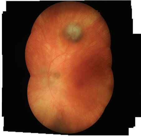
FIGURE 1: (A-B) Fundus examination of LE showed features of chronic recurrent Vogt-Koyanagi-Harada disease, including “sunset glow fundus,” hyperpigmented striae, and multiple atrophic chorioretinal spots in the periphery (not shown); darkly pigmented exuberant subretinal mass extended to the periphery with associated subretinal fibrosis. There were 2 smaller pigmented subretinal lesions located around the optic disc.