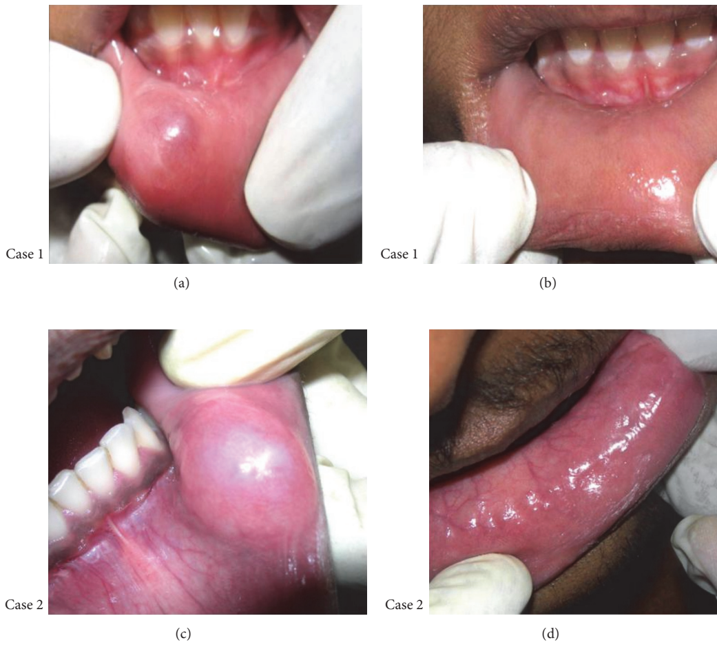
FIGURE 2: Case 1 showing mucocele in right lower labial mucosa measuring 5 * 5 mm in size (a), complete regression of lesion after 2 intralesional injections (b), Case 2 showing large mucocele in left lower labial mucosa measuring 20 * 15 mm in size (c), and complete regression of lesion after 4 intralesional injections (d).