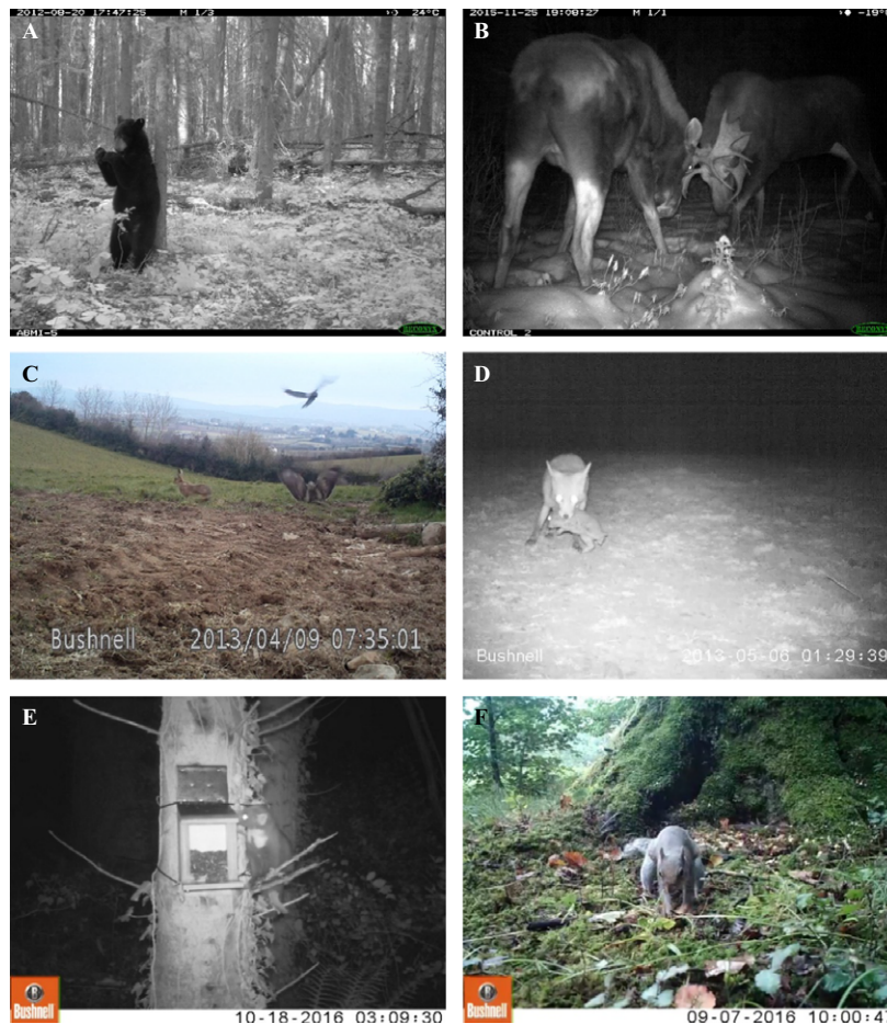
Figure 1. Examples of animal behaviour captured by camera traps: (A) Scent marking by an American black bear ( Ursus americanus ); (B) intraspecific competition in moose ( Alces alces ); (C) interspecific interactions between a European hare ( Lepus europaeus ; anti-predator response), a common buzzard ( Buteo buteo ; avoidance and attempted predation) and a hooded crow ( Corvus cornix ; anti-predator behaviour) captured on video (available at 10.6084/m9.figshare.4508369 ); (D) predation of a European rabbit ( Oryctolagus cuniculus ) by a red fox ( Vulpes vulpes ); (E) investigation of a squirrel feeding station by a pine marten ( Martes martes ); (F) nut caching by a grey squirrel ( Sciurus carolinensis ).

now being duplicated in other parts of the world. Picman and Schriml (1994) observed the predators of quail ( Coturnix coturnix ) nests in a variety of habitats, elucidating temporal variation and relative importance of each predatory species. The application of this method to the study of threatened avifauna has clear conservation benefits via the identification of direct impacts on egg success and the development of appropriate mitigation and monitoring techniques. Similarly, cameras provide more accurate post-hibernation den-emergence estimates for American black bears ( Ursus americanus ) than conventional methods, that is, den visits and radio telemetry (Bridges et al. 2004). Long-term monitoring of emergence relative to climate may yield important insights into the effects of climate change on black bears and other hibernating species (sensu Bridges and Noss 2011).