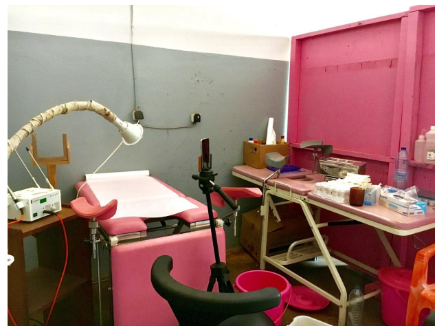
Figure 2 Device including the gynecological table, smartphone and tripod.

Once the patient record was created, the cervical images were acquired in a precise sequence: native, VIA, VILI and posttreatment whenever this was performed. The flash