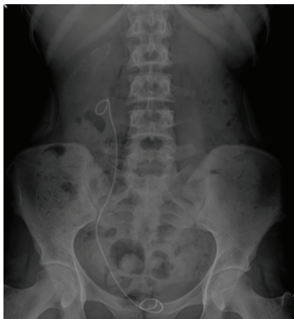
FIGURE 3: The right kidney was stone-free and perirenal collection of stone fragments was visible on kidney, ureter, and bladder X-ray after the second operation.

undesired effect. More effective drainage methods, without being more invasive, can make micro-PNL method safer and more preferable.