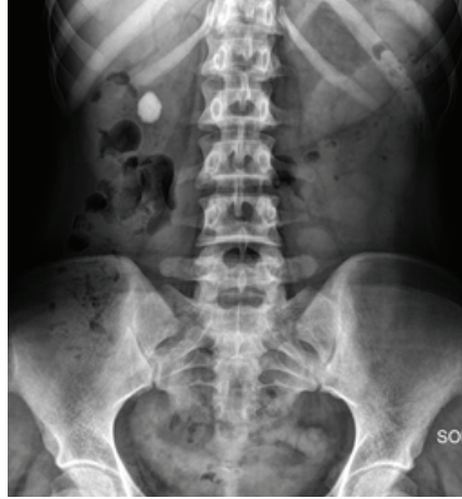
FIGURE 1: Preoperative kidney, ureter, and bladder X-ray of patient.