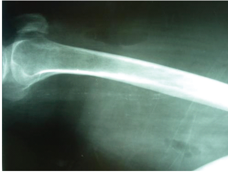
FIGURE 1: Plain lateral radiograph shows the right femur. Subcutaneous emphysema is observed as gas in the fascial planes between muscles and subcutaneous tissues.