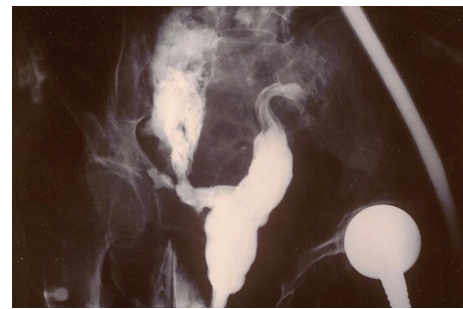
FIGURE 3: Plain anteroposterior radiograph showing the pelvis 5 minutes after per rectum administration of gastrografin. A rectal perforation allows gastrografin to escape into the pelvic cavity.