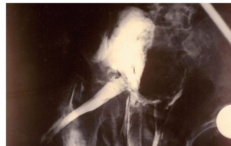
FIGURE 4: Plain anteroposterior radiograph showing the pelvis 7 minutes after per rectum administration of gastrografin. Gastrografin is escaping from the pelvic cavity through a fistula to the thigh.