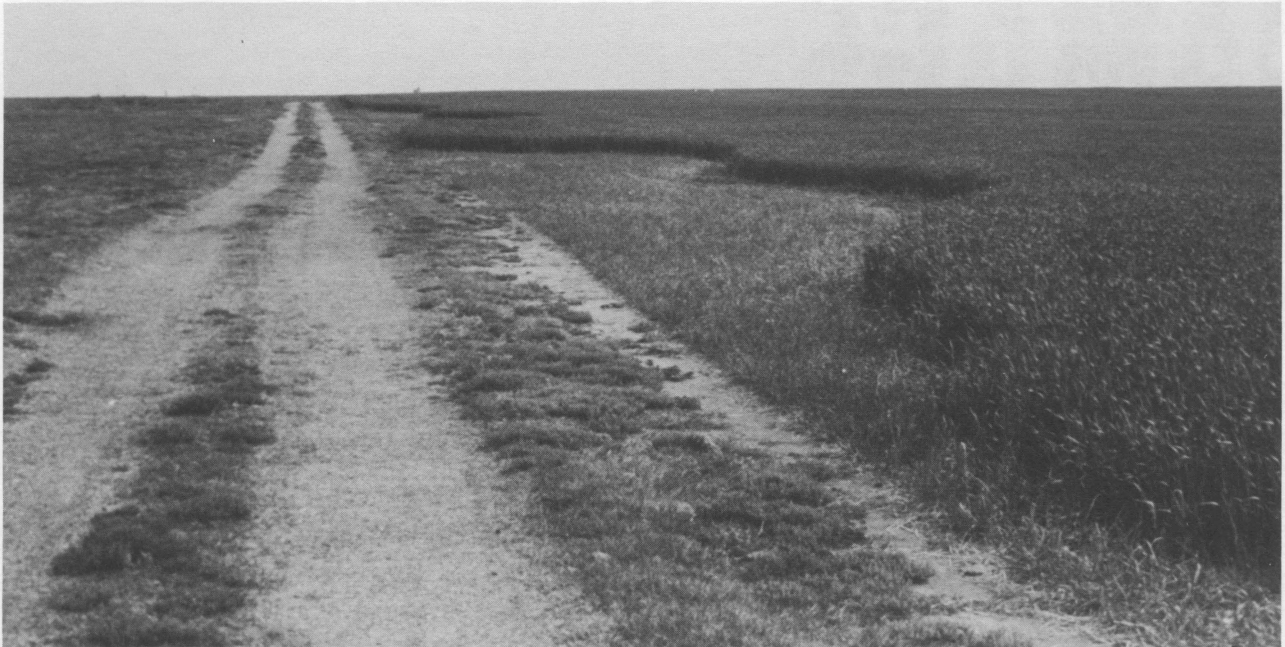
Prairie dog damage is evident in this wheat field.

if there is a chance of precipitation or if the weather is extremely cold. If baiting is done in this manner, a kill of more than 90 percent can be achieved. At the present time, zinc phosphide can be applied from July 1 to January 31 only.