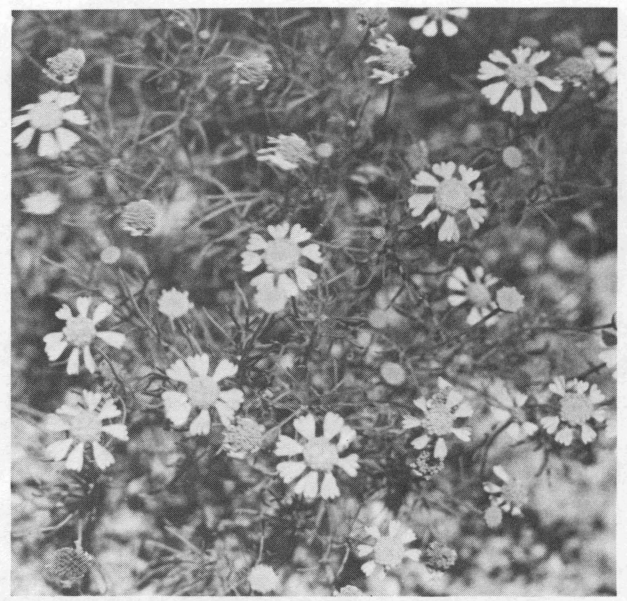
Figure 2. Mature plant of bitterweed in early summer showing finely divided leaves and flower heads with toothed rays.