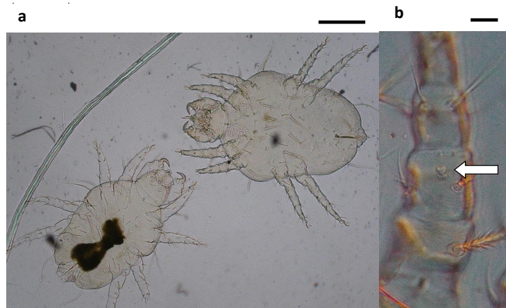
Figure 3. Light microscope photograph of the dandruff mite Cheyletiella yasguri from a dog (boxer) in Iceland. a. Adult male (bottom left) and an adult female (top right). b. The heart-shaped sensory organ on genu I (white arrow) is characteristic of C. yasguri . Scale bar a. 100 \mu m; b. 10 \mu m.

At least 18 parasite species have been diagnosed from imported dogs (Table 1) and 10 species have been diagnosed from imported cats (Table 2). As Giardia duodenalis , Ancylostoma sp./ Uncinaria sp. and Toxascaris leonina were diagnosed both from dogs and cats, the total number of parasite species detected from pets in quarantines in Iceland is 24.