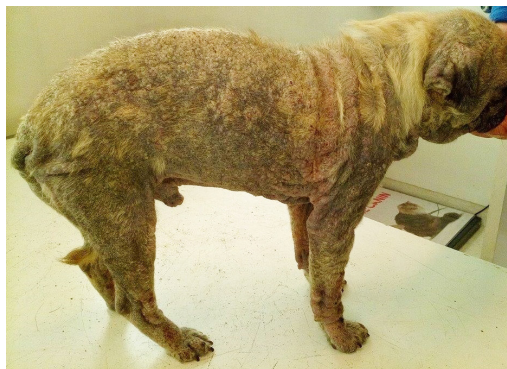
Figure 4. Icelandic pug severely infested with the demodectic dog mite Demodex canis .

Probably in 2009 the zoonotic nematode S. stercoralis (Figure 1) is believed to have been introduced with an imported dog to a kennel in Iceland which housed roughly 200 dogs, in spite of the required anthelmintic treatments during quarantine. At this time, however, the additional treatment, specific against S. stercoralis performed nowadays during quarantine, was not done. In 2012 faecal examinations confirmed that approximately half of the dogs in the kennel had a S. stercoralis infection. In addition, some household dogs recently purchased from the kennel were found to be infected, and dogs that had been in contact with infected dogs from the kennel had also acquired the infection. Intensive search for infected dogs, and repeated, systematic anthelmintic treatments, were