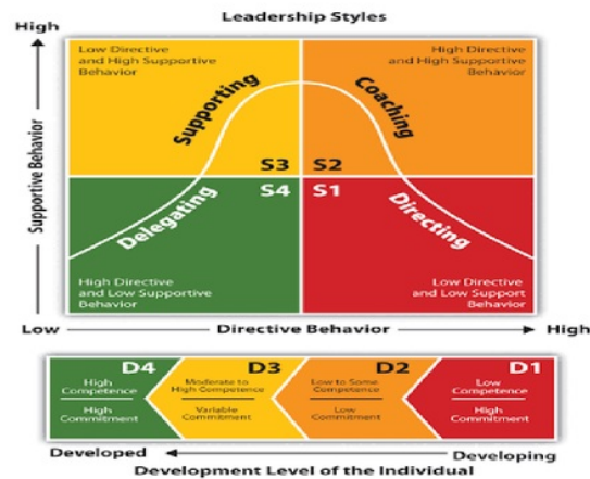
Fig. 2. The link between situational leadership and followers readiness

When it is related to situation theory from Hersey and Blanchard, this theory is focus on followers readiness as the key of situation that determine behavioral effectiveness of a leader is a teacher. This situation finally force teacher to ask their student to participate actively and give them motivation to grow optimally by participating, student will be more confident in doing tasks given to them [15]. This shows that right leadership style shown that leadership style was hoped to be adapted with students' abilities and give good motivation so their discipline will increase. The link between situational leadership and followers readiness can be seen in figure 2.