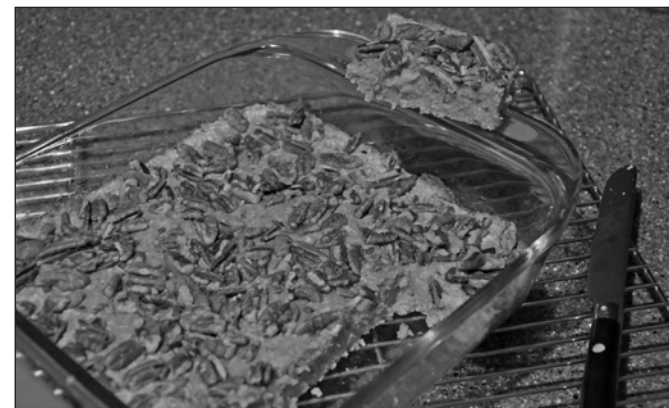
Celebrate National Pecan Month with these tasty breakfast bars!