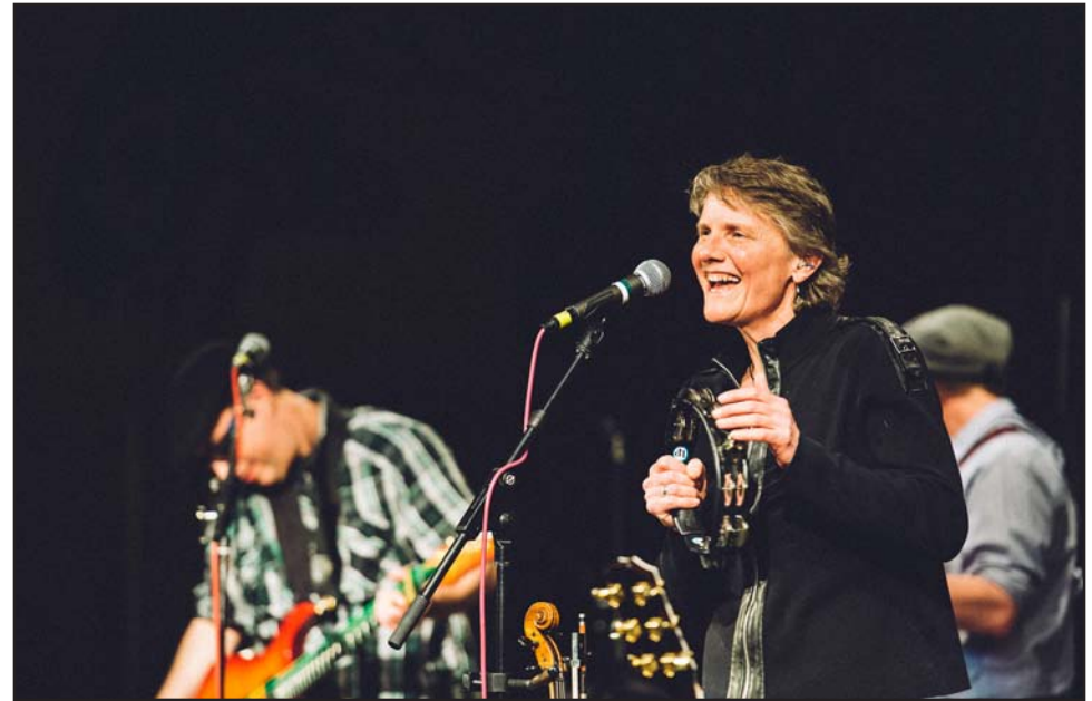
Fire on McGinnis, a Celtic Rock group formed in Juneau, takes the stage at this year's Alaska Folk Festival.

For more information on the Alaska Folk Festival, be sure to visit their website at www.akfolkfest.org ! They have performer and volunteer applications, links to YouTube videos, dates for planning meetings, and even Folk Fest poster art.