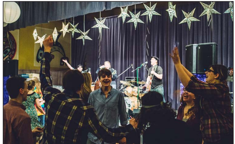
The Folk Fest crowd is all smiles as they rock out to Fire on McGinnis.