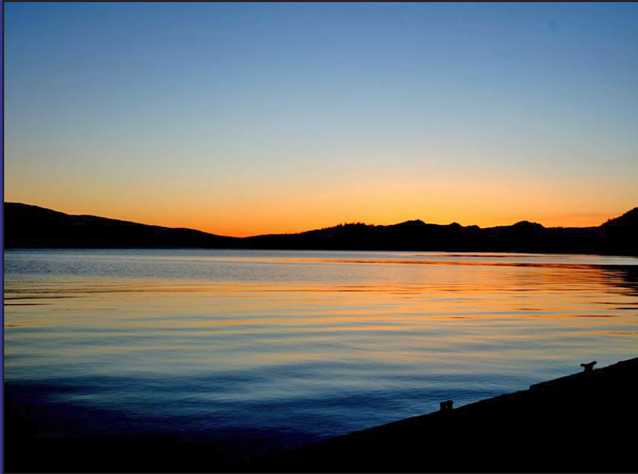
Katie Rueter's colorful "Sunset at Auke Bay". (Photograph provided by Katie Rueter)