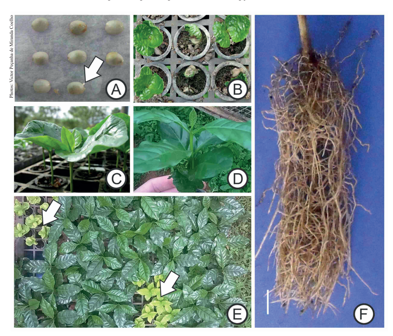
Figure 1. A-G) Timeline for coffee seedling production from germination up to 120 days after planting (DAP); A) germinated seeds (arrow); B) plants in the 'matchstick' and 'panther ears' stages, approximately at 10-20 DAP; C) plants with 1 leaf pair at 45 DAP; D) plants with 2 well-developed leaf pairs at 80 DAP; E) plants with 3 or 4 leaf pairs at 120 DAP, with arrows indicating seedlings without fertilizer (0.0 dS m<sup>-1</sup>); F) roots at 120 DAP (1.0 dS m<sup>-1</sup>), with bar = 1 cm.