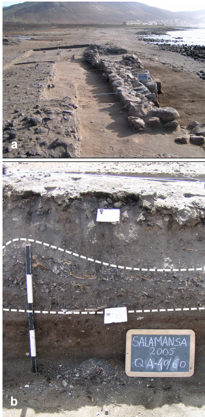
Figure 3 Archaeological excavation at the settlement site of Salamansa: a) overview of the archaeological site; b) stratigraphic profile of the section from which the samples Salamansa QA Am1 and QA Am2 were collected. Organic remains (goat bones, marine shells, turtle carapaces and plastrons, charcoal) between the 2 dashed lines.