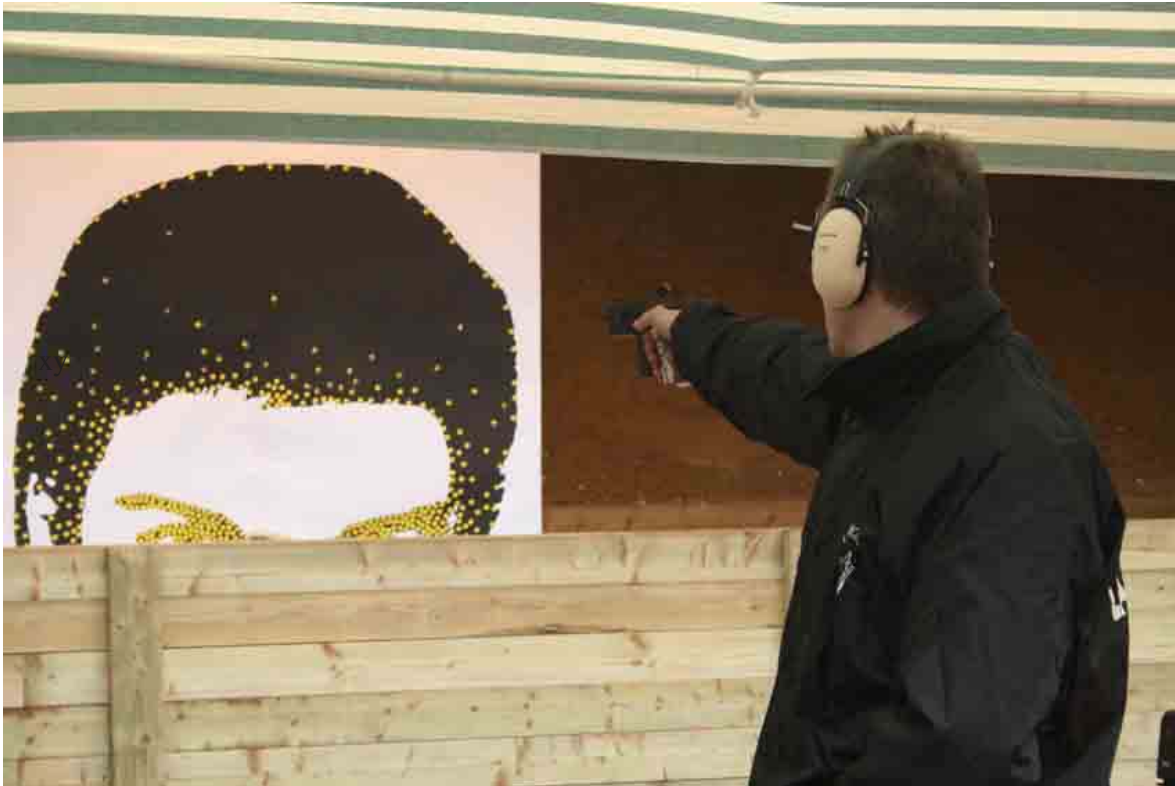
Erinç Seymen, Portrait of a Pasha , 2009 Photo: Cuneyt Cakirlar. Courtesy of galerist and the artist. Reproduced with permission.

for translating a rumoured-thus-fantasized encounter into a deviant artistic pleasure, so as to disclose 'the homosexual' as the repudiated, but constitutive abject-other of the militarist nationalist masculinity.