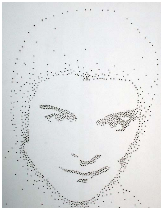
Erinç Seymen, Portrait of a Pasha , 2009